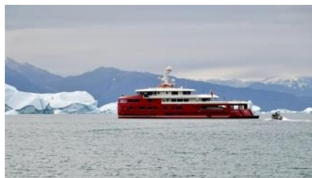
MY Akula - Augmentum

Researchers from the National Oceanography Centre (NOC) have begun ground-breaking Arctic fieldwork in the fjords around Greenland, supported by Augmentum . The team from NOC boarded Augmentum’s vessel MY Akula in August to investigate the impact of glacial melt on Dissolved Organic Carbon (DOC) cycling and microbial biodiversity in Greenland’s Sermilik, Narsarsuaq and Qaqortoq fjords.