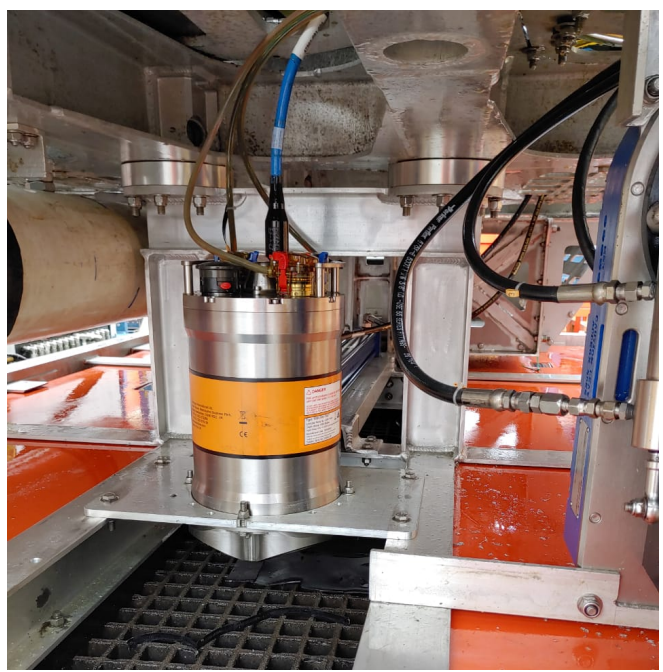
Sonardyne's hybrid navigator SPRINT-Nav has been chosen by C-Innovation for its ROVs in Brazil.

will be working for Karoon Energy. The scope of work is subsea inspection, maintenance and repair operations (IMR) and ROV support. Five of the six vessels, which start contracts in Brazil this year, are already equipped with Sonardyne's Ranger 2 Ultra-Short BaseLine (USBL) positioning system, which is used for both dynamic positioning (DP) reference and deep water target tracking.