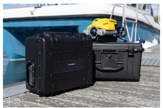
Sonardyne's updated Micro-Ranger 2 USBL system contains everything you need to track divers, ROVS and AUVs in a rugged case small enough to operateanywhere, from anything.

The needs of AUV developers who need to both track and communicate with targets have been addressed with the Micro-Ranger 2 integrator system kit. It comes complete with Sonardyne's add-on Marine Robotics software pack and AvTrak 6 Nanos, which support two-way messaging, vehicle control and tracking in one small instrument.